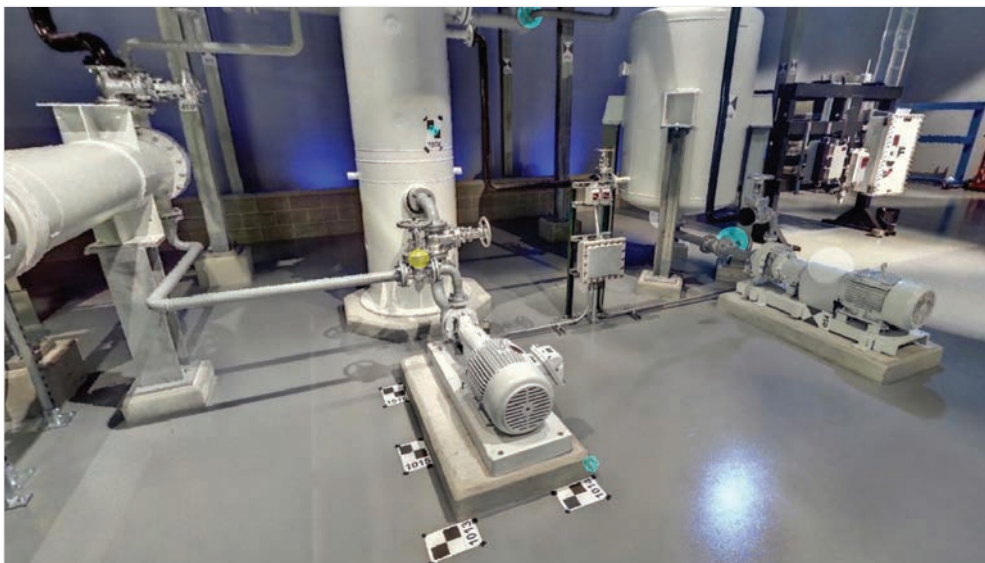
The Viewer functionality provides a window into your point cloud data. The BubbleView gives you like a bird's-eye view in which 3D data can be measured and intelligence added to it.